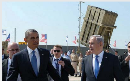
President Obama and Prime Minister Netanyahu visiting an Iron Dome battery in Israel.

Israel by Hamas has highlighted the urgency of Iron Dome, and its success has generated much enthusiasm. During the third week of Operation Protective Edge, Defense Secretary Chuck Hagel declared that "Iron Dome has saved countless Israeli lives." Hagel is requesting an immediate grant of an additional $225 million for the acceleration of Iron Dome production, besides another $351 million that was already under discussion for fiscal year 2015, which begins in October of this year. ■